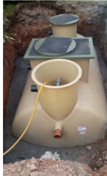
Installed and ready to connect