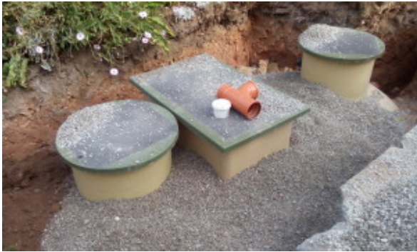
System Ready to Backfill