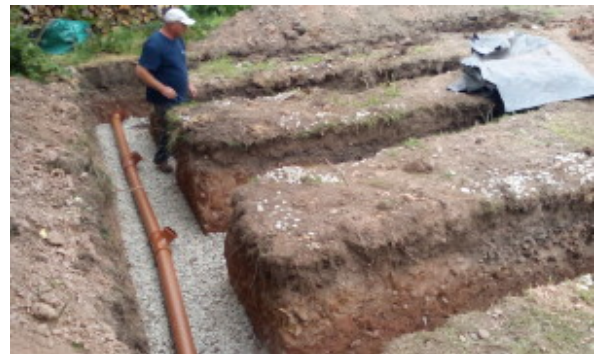
Drainage Field Excavated