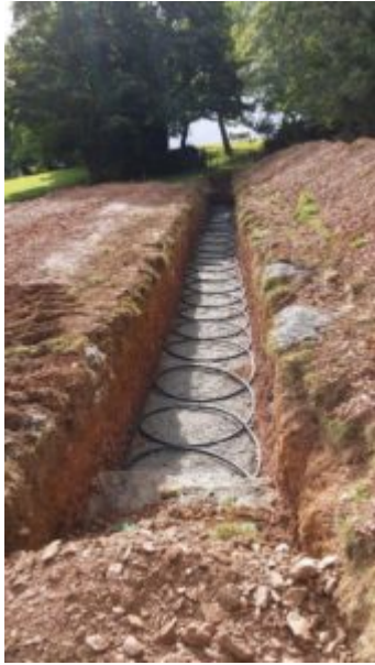
Slinky Install in Cornwall