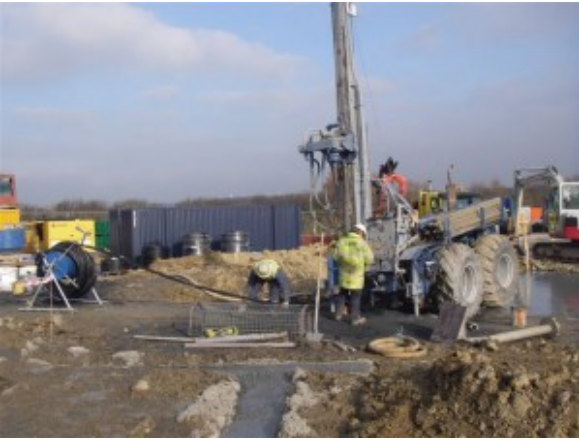
Ground Source Heat Pump Drilling for a Commercial Venture