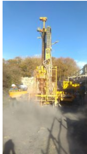
Groundsource Drilling in Cornwall

One or more coils of Polyester pipe are laid in trenches and the ends brought back to a manifold before connecting to the heat pump.