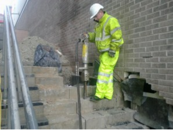
Removing Concrete Staircase

For a client involved in a sensitive project in St Austell's White River shopping complex we were tasked with removal of an existing staircase with minimum disruption to site users and the public.