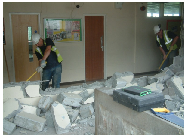
Structural Alterations to existing Structures.