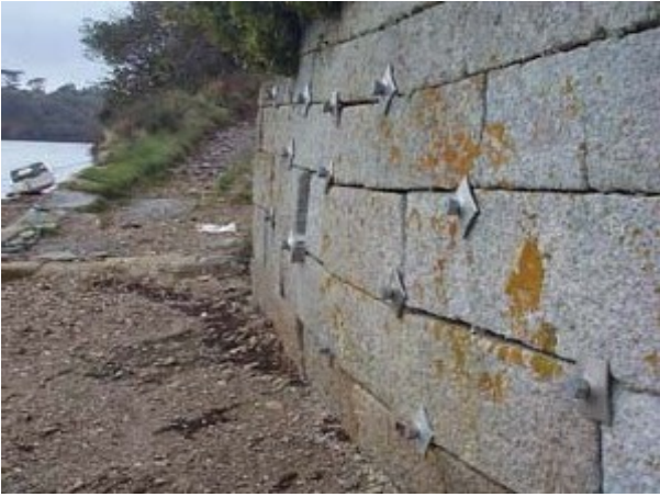
Rock Anchoring and Soil Nailing