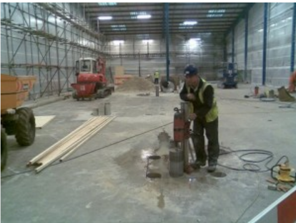
Concrete Core Drilling