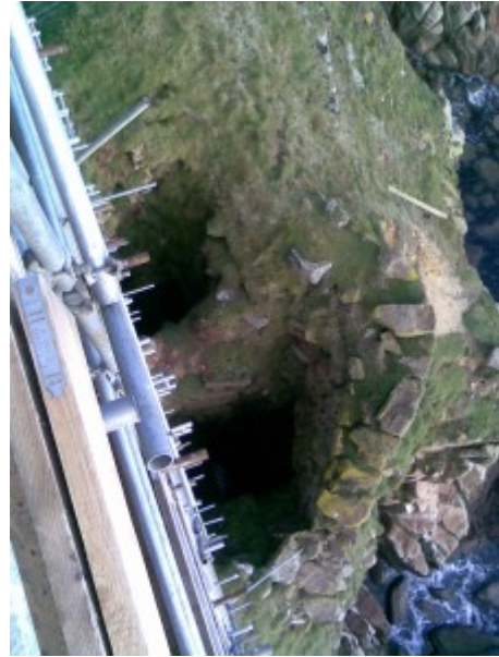
Mine Shaft capping and remediation of Mining affected properties.

Please ring 01726 824837 or email mark@aquasourceLtd.co.uk for more details