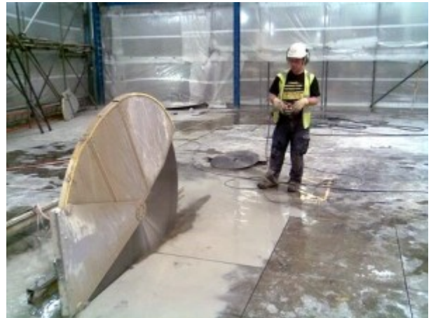
Floor Sawing and Concrete Cutting