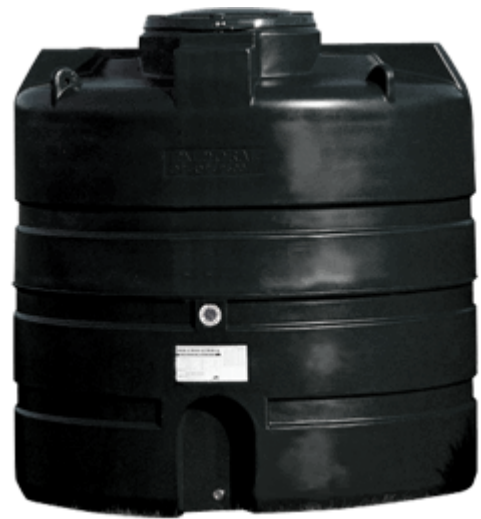
Water Tanks:- Supply and install