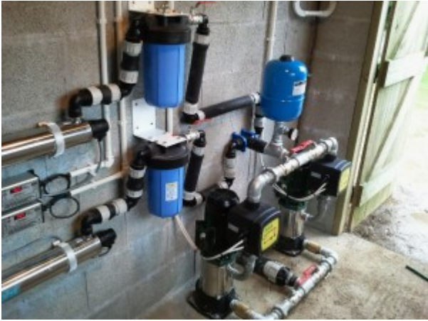
Filtration and Pumping