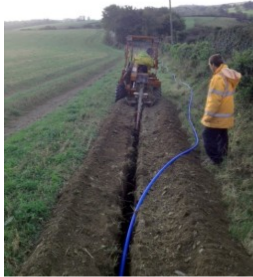
Trenching and Pipe Laying