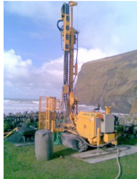
Ground Source Heat Pump Supply and Install