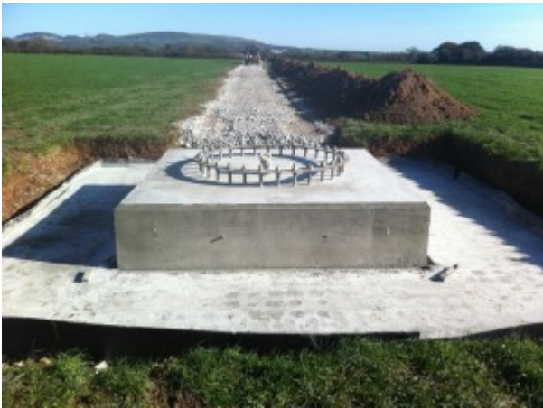
Wind Turbine Base Construction