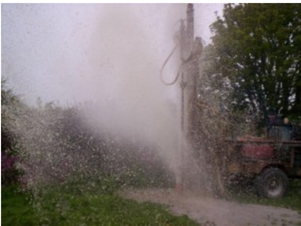
Water Borehole Drilling

Aquasource (SW ) Ltd are providers of Water Borehole Drilling, Private Water Solutions, Waste Water Solutions, Specialist Contracting and Ground Source Heat Installations.